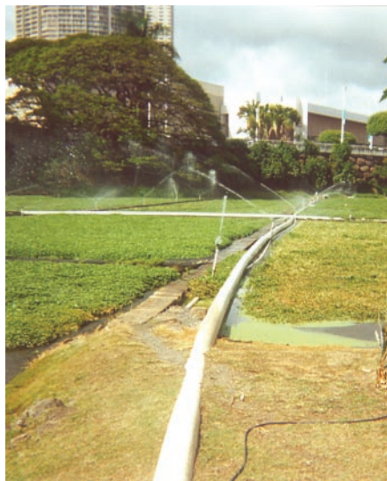
Fig. 1. In this field of water cress, the world’s biggest selling biopesticide, Bacillus thuringiensis (Bt) toxin, was overcome by the evolution of resistance in diamondback moths. This pesticide is engineered into millions of acres of crop plants, and so the ability of insects to evolve resistance has created anxiety in the biotechnology industry.